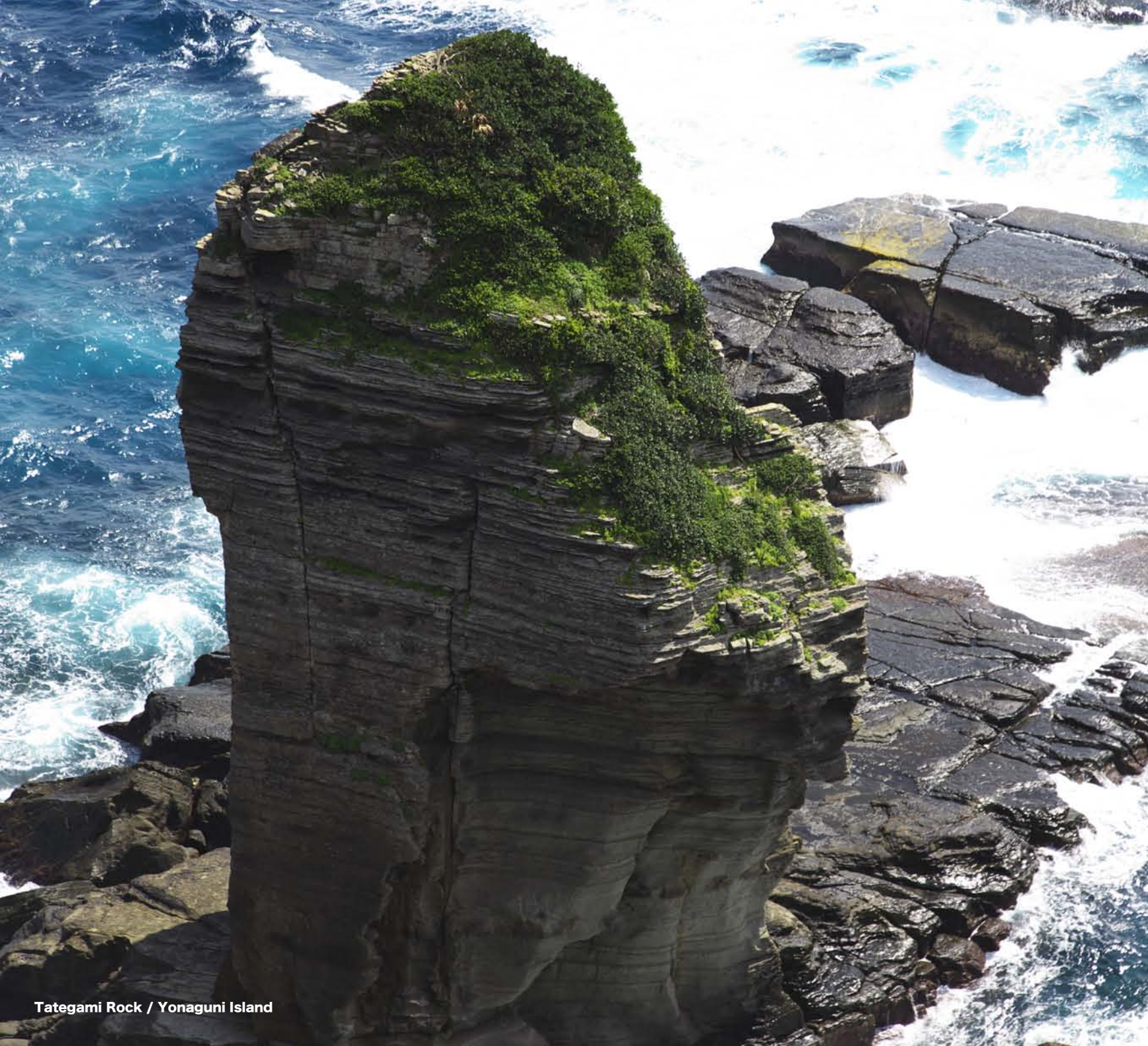
Tategami Rock / Yonaguni Island