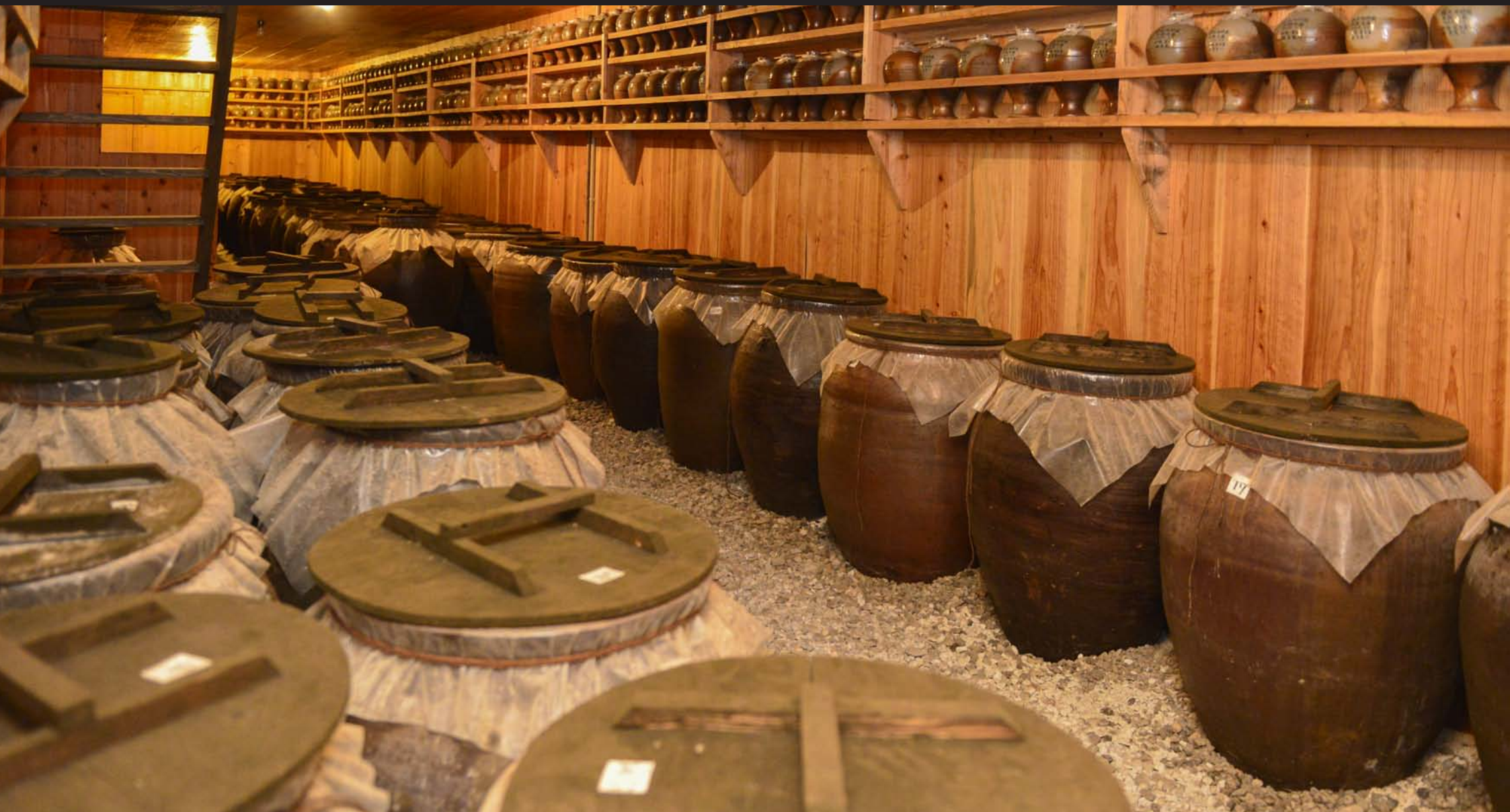
Awamori (Okinawan liquor) warehouse