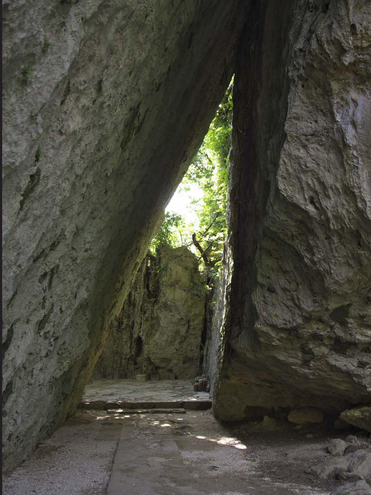
Sefa Utaki / Okinawa Island