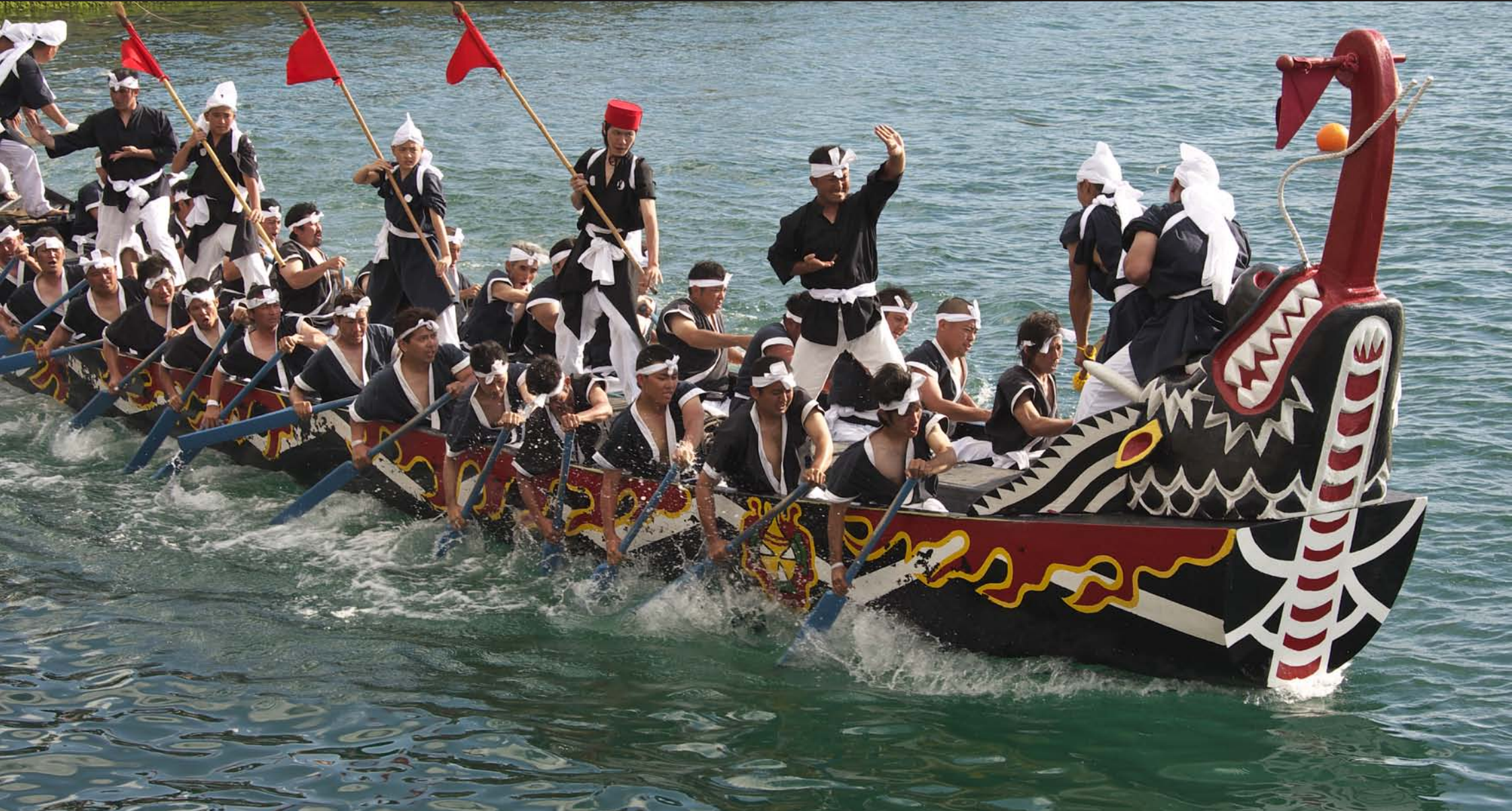
Naha Hari Dragon Boat Race / Okinawa Island