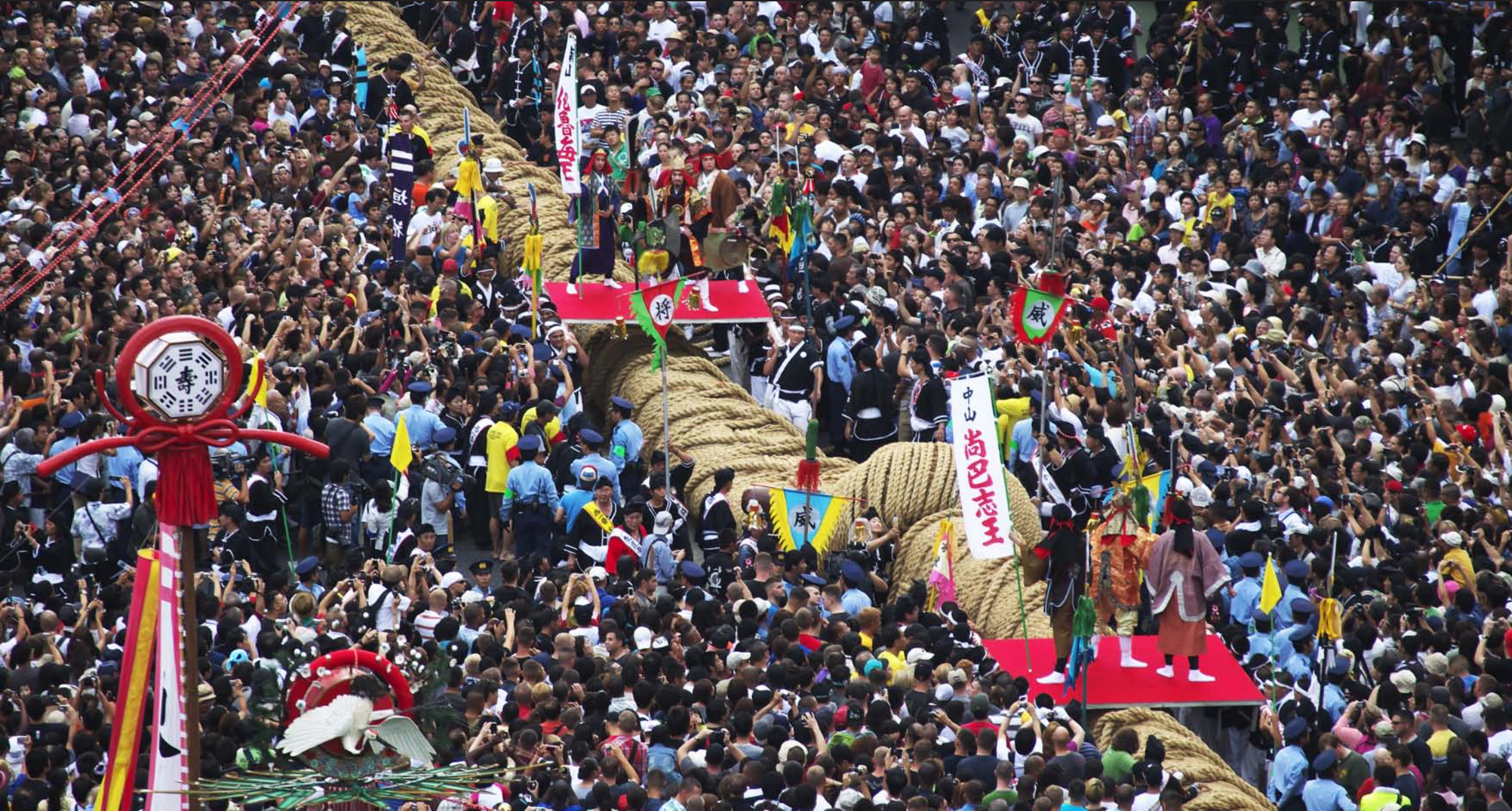
Naha Giant Tug of War / Okinawa Island