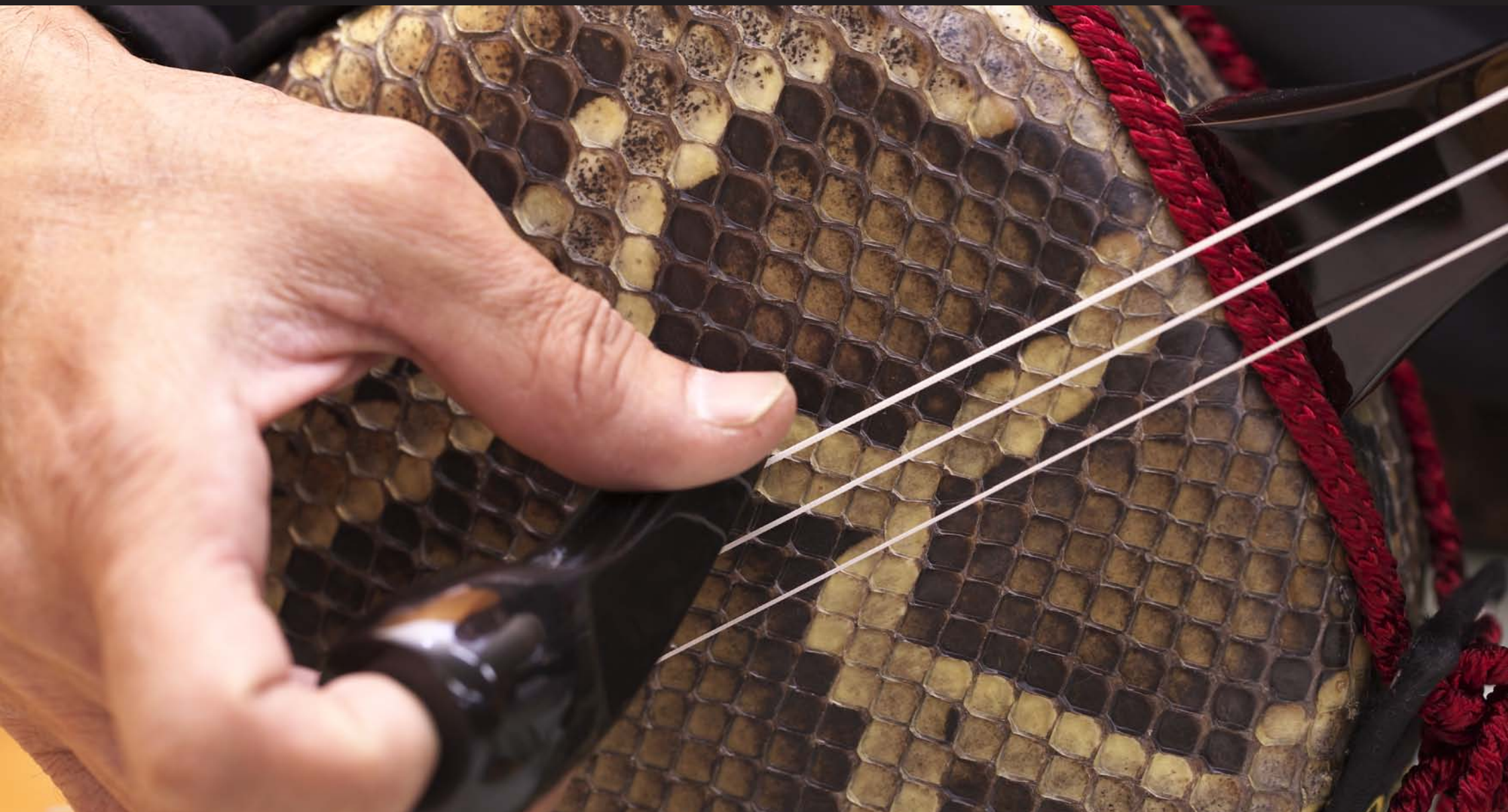
Sanshin (three-stringed lute)