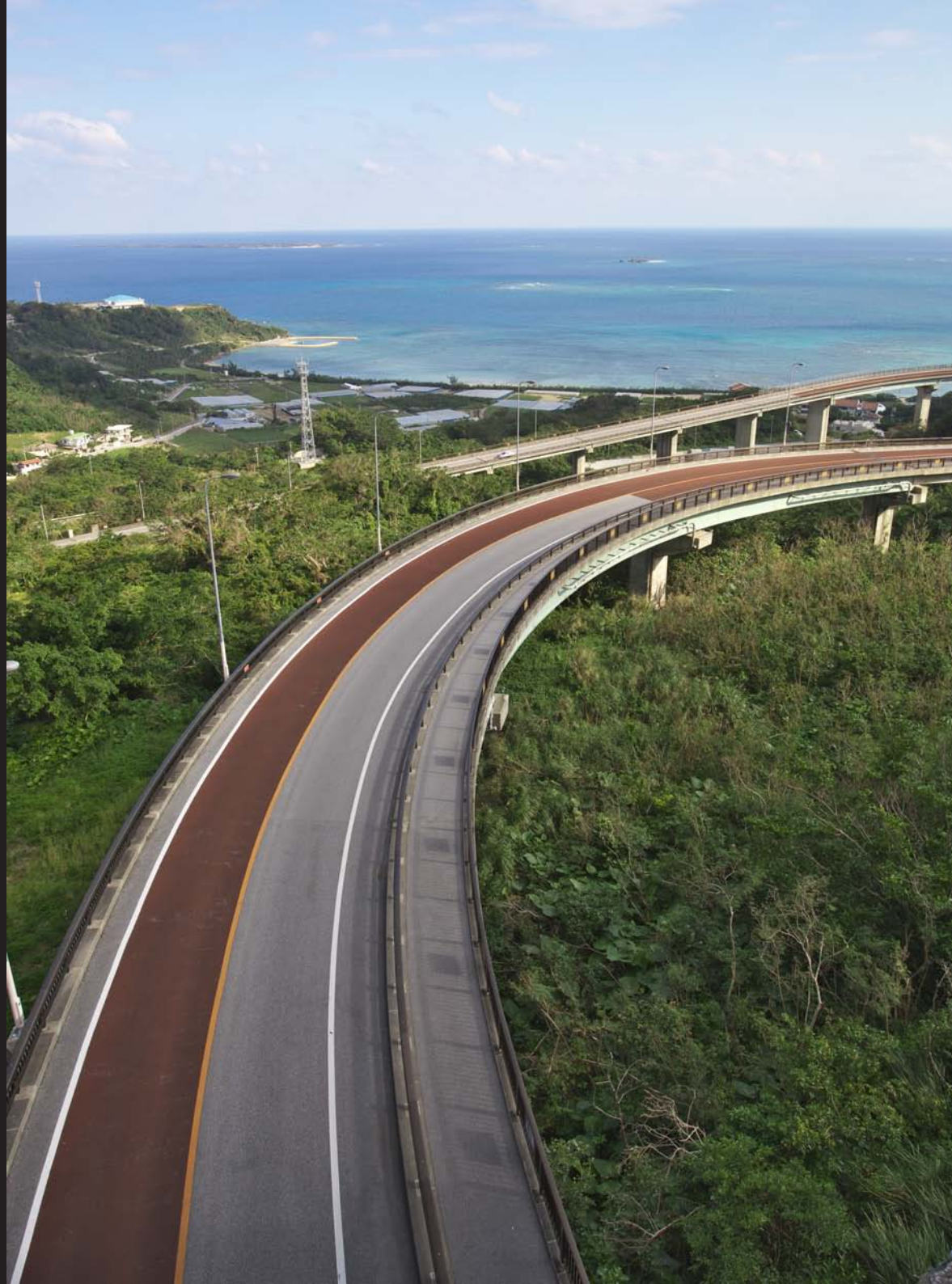
Nirai kanai Bridge / Okinawa Island