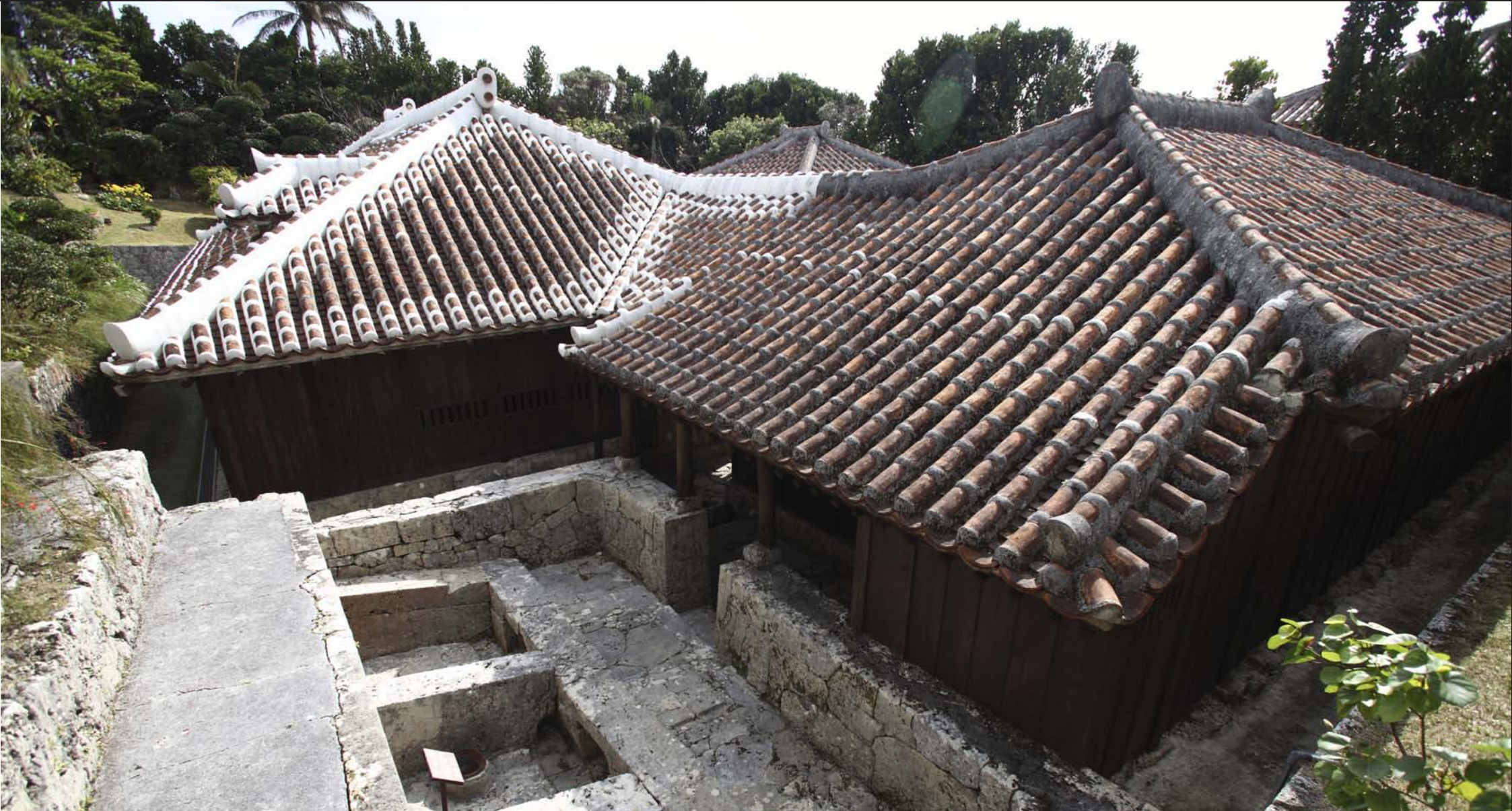
Nakamura House / Okinawa Island