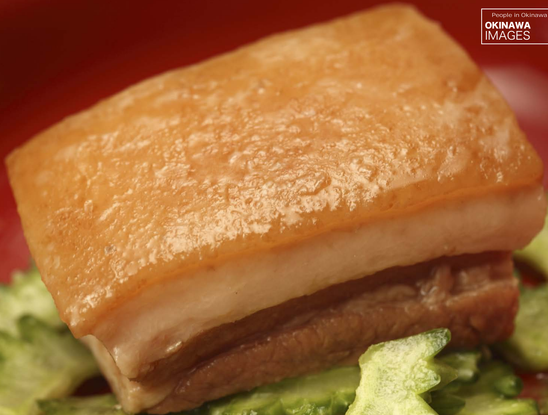
Rafute (Simmered pork belly)