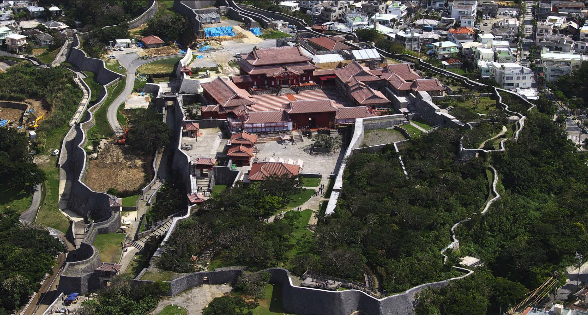
Shuri Castle / Okinawa Island